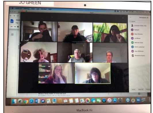
Our weekly staff meeting online via Zoom!

Week 4 Eketahuna School Booking Schedule